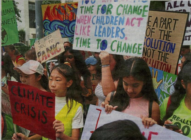
Young demonstrators taking part in the Global Climate Strike protest in Bangkok in September.

Since she set up the Facebook page "Climate Strike Thailand", it has attracted almost 5,000 followers.