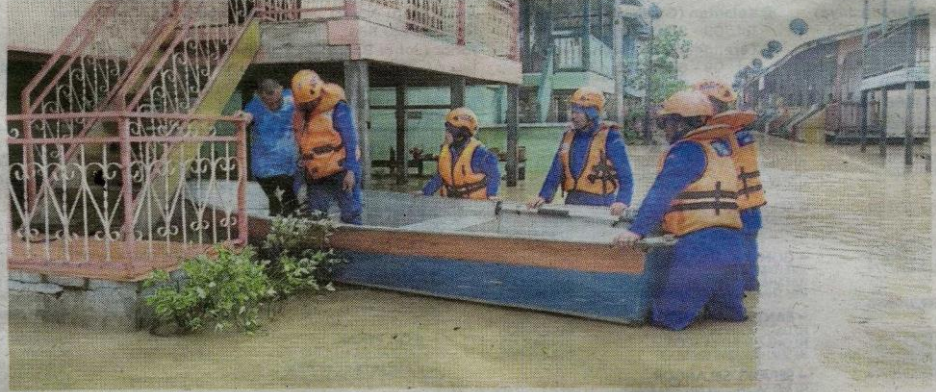
ANGGOTA APM membantu penduduk kampung keluar selepas banjir kilat di Tawau.