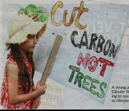
A young activist participating in the Global Climate Strike. Youngsters in Bangkok are starting to speak up on issues that affect them, such as climate change.

"Initially I had no idea about Thai social media and how to deal with Thai culture and Thai people and changing their mindset, but since March I've learned so much," she said.