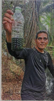
Kicking up a stink: A villager (above) showing a sample of the foul-smell water taken from a polluted trench.

"We believe all problems can be solved if all related agencies and