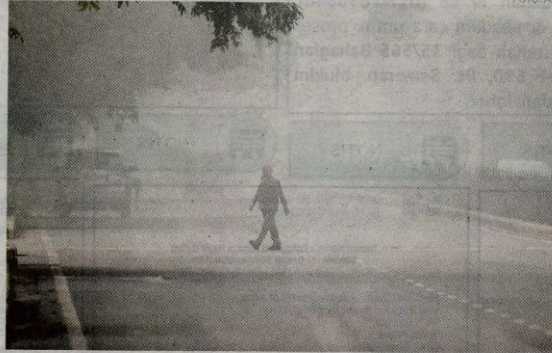
Seorang lelaki melintasi jalan raya di tengah-tengah jerebu beracun yang sedang melanda New Delhi.

semakin memburuk sejak tiga tahun lalu dan Ketua Menteri New Delhi, Arvind Kejriwal menggesa kerajaan melakukan